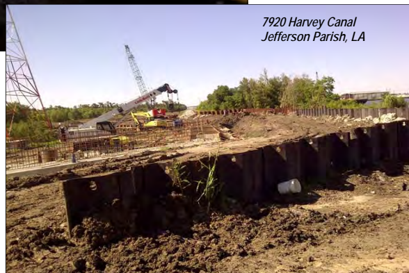
7920 Harvey Canal Jefferson Parish, LA