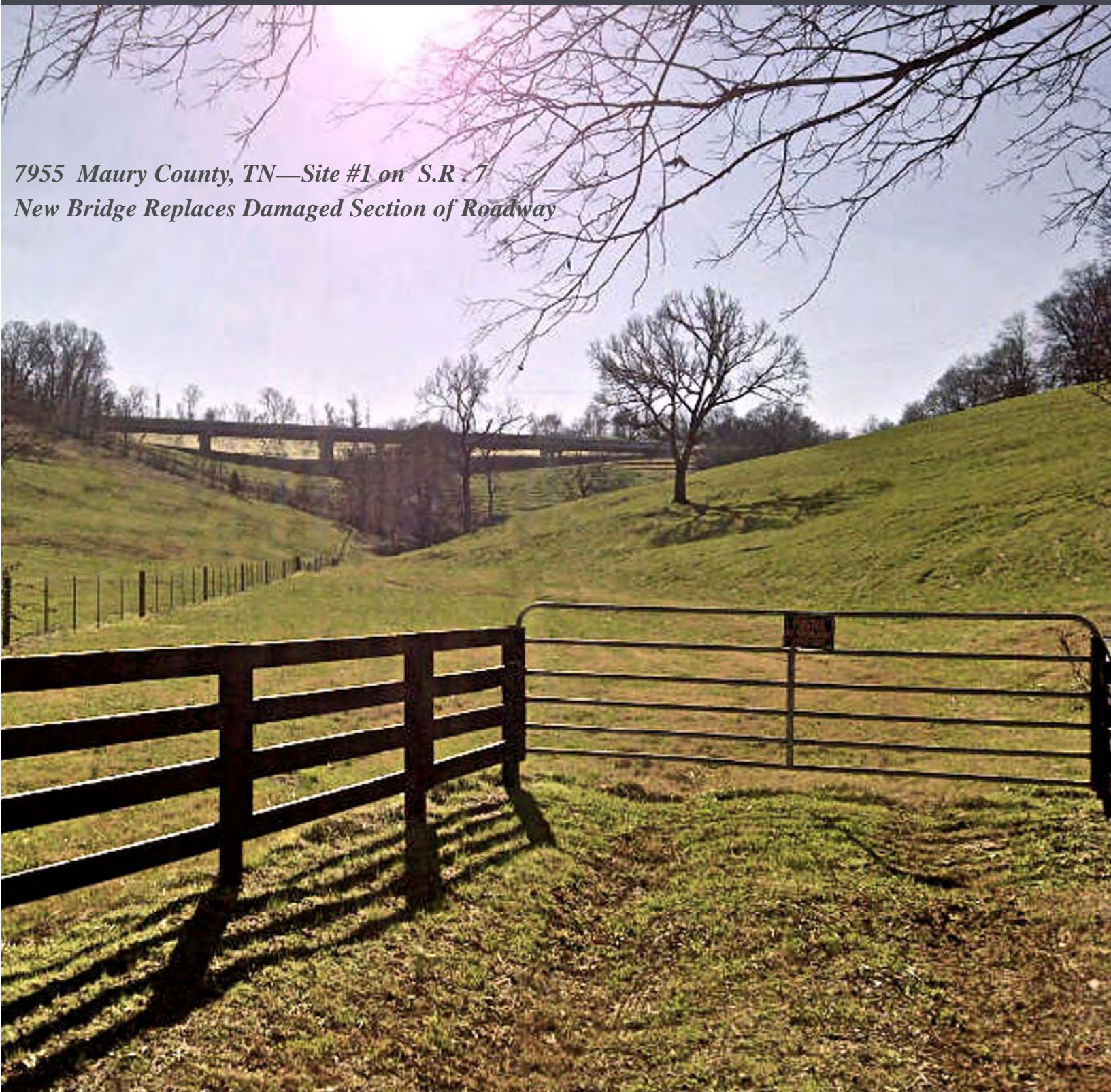
7955 Maury County, TN—Site #1 on S.R. 7 New Bridge Replaces Damaged Section of Roadway