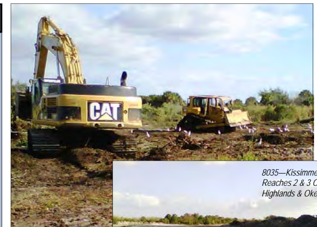
8035—Kissimmee River Restoration Reaches 2 & 3 Oxbow Excavation Highlands & Okeechobee Cos, FL