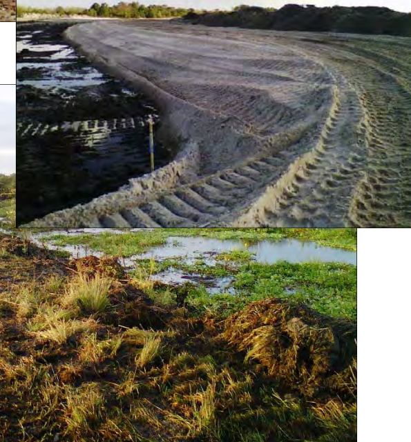
8035 - Site Conditions as Clearing and Grubbing operations begin at the Kissimmee Oxbow Project in December.