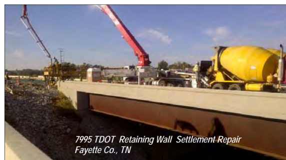
7995 TDOT Retaining Wall Settlement Repair Fayette Co., TN